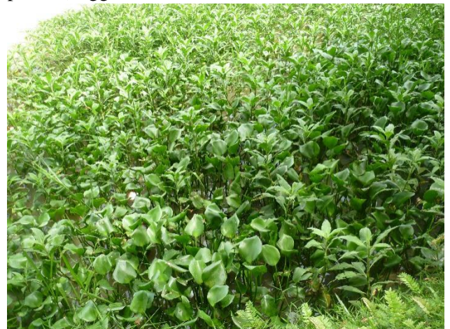
Figure 4: The infestation of water hyacinth, Eichhornia crassipes at the edge of the water body

Water hyacinth often disturbing and destroy native flora and fauna habitats by competes with the native plants, displacing wildlife habitat and forage (Henderson, 2001). Hanging roots of water hyacinth also traps moving sediment, combine with detrital production and siltation under water hyacinth mats results in higher sedimentation loading (Nel et al., 2004). Furthermore, water hyacinth infestation management through mechanical harvesting or herbicidal treatment will cause damages to nearby desirable vegetation such as ornamental plants (Higgins et al., 2001).