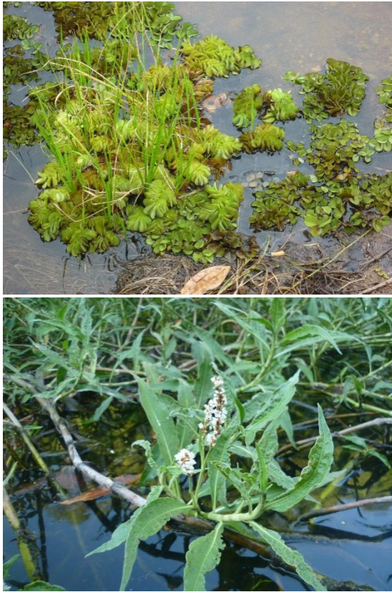
Figure 3: The population of macrophyte, Salvinia sp. (left) and Persicaria sp. (right) that can be found at the lakes