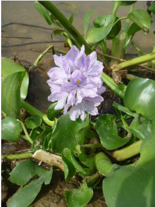
Figure 5: The blooming violet flower of Eichhornia crassipes

According to Stuckey and Les (1984) in Florida, water lettuce Pistia stratiotes is one of the invasive floating aquatic weed. Infestation of water lettuce mats able to block navigational channels, impedes water flow in flood control canals and irrigation canals, and disrupting submerge flora and fauna, recorded since 18 th century. Similar to water hyacinth, roots of water lettuce, composed of long adventitious roots aligned with extensive lateral rootlets. These extensive infestations accelerate siltation rates as they begun to slow the water velocities in rivers or streams. Consequently, benthic substrates degradation under water lettuce mats resulted in creating unsuitable habitats and nesting sites for many kind of fish species, as well as macroinvertebrate (Görgens and Wilgen, 2004). Likewise, water lettuce has the ability to bioaccumulate noticeable amounts of heavy metals, so the detritus under the water lettuce mats could be highly toxic (Sridhar, 1986).