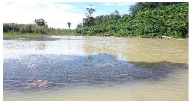
Figure 2: The colony of submerged aquatic plant, water thyme Hydrilla sp. at Chenderoh Reservoir, Perak

There are three groups of plants that grow in littoral zones. Emergent plants inhabit the shallowest water with their roots in the sediment and their leaves are extending above the water surface. Common reed, spike rush and cattail are the representative species of emergent plants (Mashhor et al., 2002). Floating-leaved plants grow at intermediate depths and some of this species are rooted in the sediment. Water lily is in this group. While others are free floating with roots that hang unanchored in the water column. Water lettuce and water hyacinth are the two examples of free floating aquatic plants (Haller, 2009). Plants that grow their stems and leaves entirely underwater are known as submerged plants. Submerged plants display a wide range of plant shapes and grow from near shore to the deepest part of the littoral zone. Submerged plant species are including Hydrilla , Cabomba and Egeria (Haller, 2009). Figure 2 and Figure 3 showed macrophytes population in Chenderoh Reservoir, Perak.